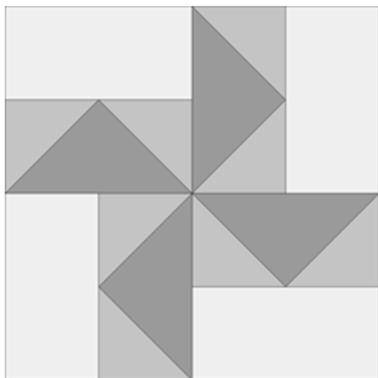
Figure 1 - Viewed from the fabric side...

For step-by-step instructions to make this paper pieced quilt block, visit: https://www.generations-quilt-patterns.com/louisiana-quilt-block.html